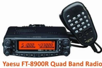
Yaesu FT-8900R Quad Band Radio